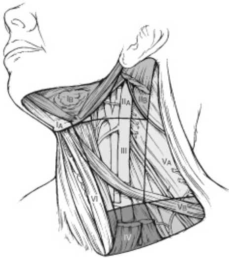
Figure 2. The six sublevels of the neck for describing the location of lymph nodes within levels I, II, and V. Level IA, submental group; level IB, submandibular group; level IIA, upper jugular nodes along the carotid sheath, including the subdigastric group; level IIB, upper jugular nodes in the submuscular recess; level VA, spinal accessory nodes; and level VB, the supraclavicular and transverse cervical nodes. From: Flint PW, et al, eds. Cummings Otolaryngology: Head and Neck Surgery . 5th ed. Philadelphia, PA; Saunders: 2010. Reproduced with permission © Elsevier.

In order for pathologists to properly identify these nodes, they must be familiar with the terminology of the regional lymph node groups and with the relationships of those groups to the regional anatomy. Which lymph node groups surgeons submit for histopathologic evaluation depends on the type of neck dissection they perform. Therefore, surgeons must supply information on the types of neck dissections that they perform and the details of the local anatomy in the specimens they submit for examination or, in other manners, orient those specimens for pathologists.