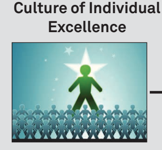
Find and reward individuals who have the right combination of skills, traits, and motivation.

Another hallmark of mistake proofing is to better balance a focus on individual excellence with a focus on process excellence.